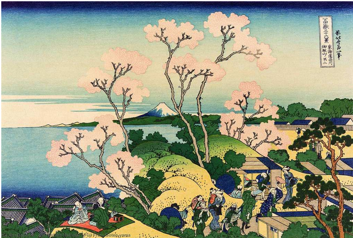
Woodblock print: FUJI FROM GOTEN-YAMA by KATSUSHIKA HOKUSAI 1831

The Japanese cherry blossom festivals take place throughout the Spring.